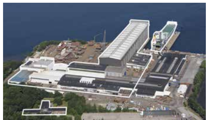
FSG shipyard - Flensburg Germany

Liquefied natural gas propulsion makes the vessel Bass Strait's first "clean green ship".